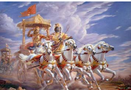
Lord Krishna commands Arjuna's chariot in the war.

The Mahabharat itself, the epic poem of the events leading up to the war and immediately after has close to a hundred thousand verses. It describes the time of the war in a month where both solar and lunar eclipses occurred within 13 days of each other. It also has various other observations which potentially indicate the season. Most astrologers in ancient times have pitched the date around 3139BCE. Modern astronomers using advanced software concur with this but also suggest other times, up to two millennia earlier (around 5000 BC), and 600 years later (2500BC).