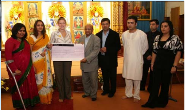
RIGHT: Presentation of cheque for £6136.41 to Marie Curie Cancer Care for the amount raised in 2007.