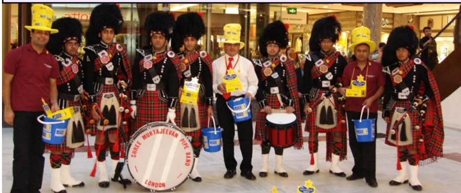
Shree Muktajeevan Pipe Band members and volunteers help with Marie Curie's Daffodil day collections in Brent Cross shopping Centre 17 March 2007.

The grant awarded is £6,300 to cover capital, training and production costs.