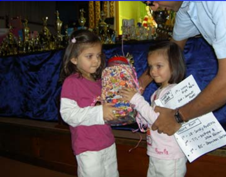
Guess the number of sweets in the jar to win it!!

HIGHLIGHTS OF THE PAST SEASON IN PICTURES