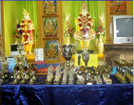
Prizes on Parade—OMG is there a Sony PS 2 in that lot!