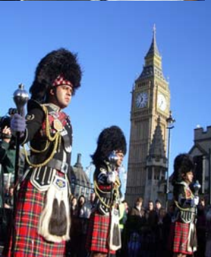
ABOVE: Band playing in London's New years parade.