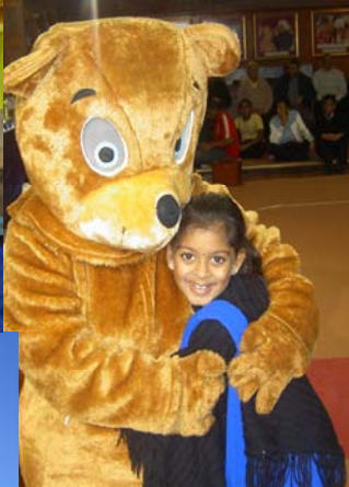
Small person being hugged by very big cuddly thingummy.